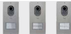
Lithos with 1 button Lithos with 2 buttons Lithos with 4 buttons

Lithos can come with single or double buttons according to the type of installation to be created (up to 4 lines). They can easily be replaced, for example to insert name tags.